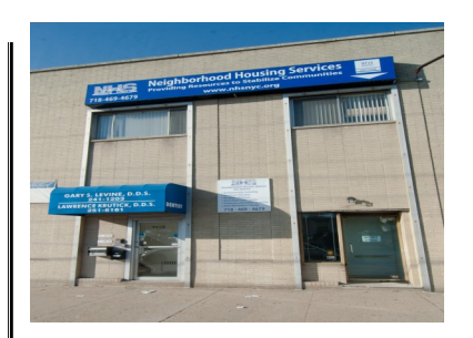
On October 7, Neighborhood Housing Services of East Flatbush (NHS) opened its doors to its new Canarsie satellite location on 9715 Ave L on the corner of Rockaway Parkway, right above an eye wear business. NHS staff combed the neighborhood that day handing out flyers to passersby, dropping in on local businesses, spreading the word of the grand opening guerilla style.

The previous NHS Canarsie office was on 9201 Flatlands Ave., a space donated by